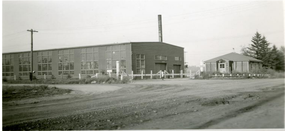
Camp Red Deer

His training starts in Red Deer, but on 20 March 1943 he is taken to the general military hospital in Regina where he stays until 16 April of that year. He then continues his training as a motor courier.