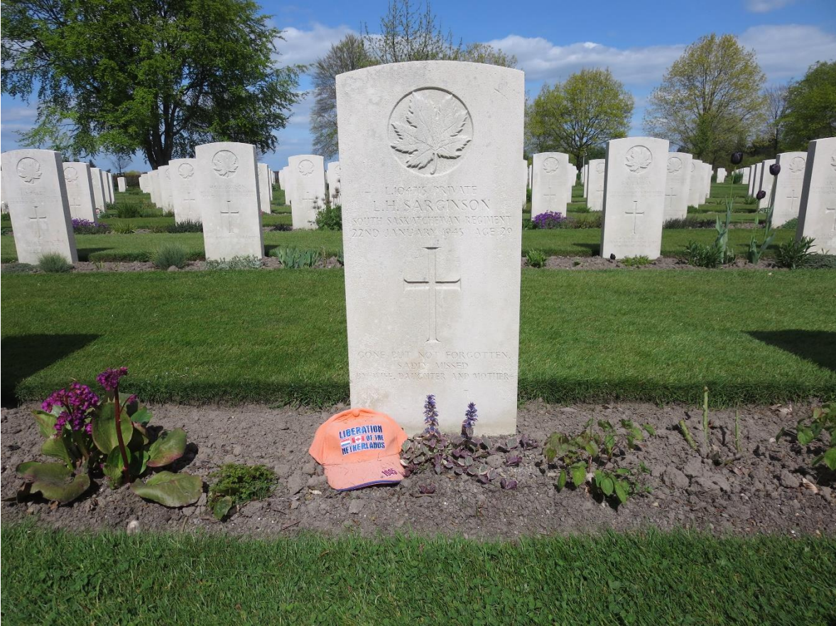
Myrna in 2001 when she visited her Dad's grave again.